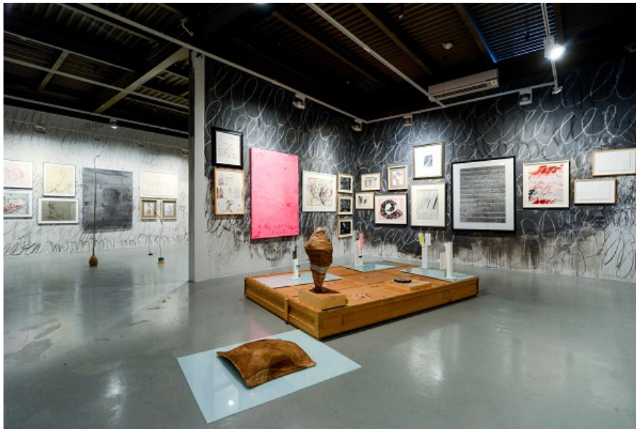
Installation view of "Cy Twombly and the Calligraphic Line."